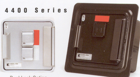
Dual Lock Option Surface Mount