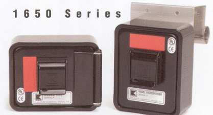
Hinged Door Surface Mount