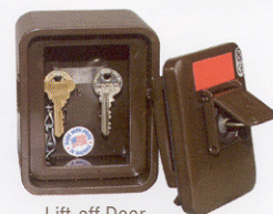
Lift-off Door Surface Mount