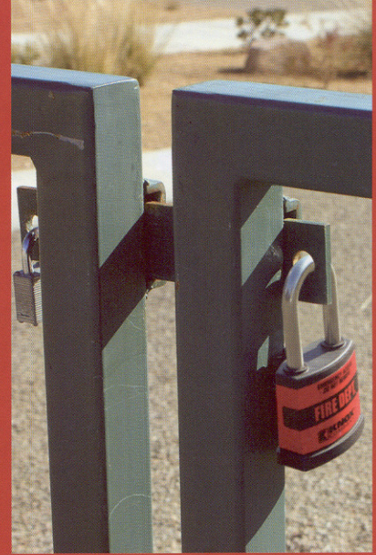
Fire Gate Padlock