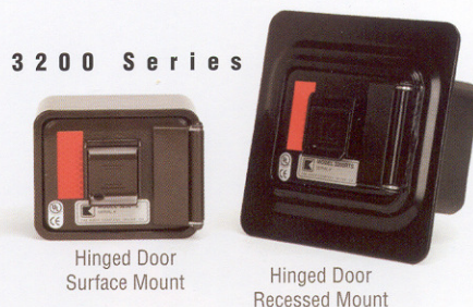
Hinged Door Surface Mount