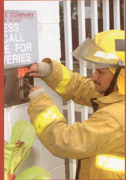
Electric Gate Entry

KNOX-BOX access provides faster emergency response without forced entry damage.