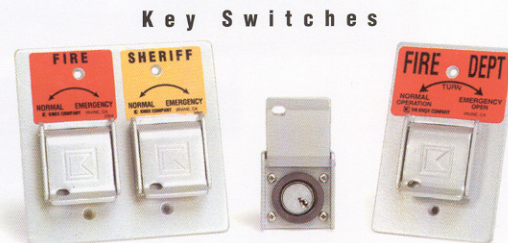
Key Switch / Heavy Stainless Cover

Options: Momentary switch available. For custom switch applications, consult factory.